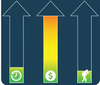
IMPACT ON OWNER

I need someone to create a design, the blueprints and to execute construction.