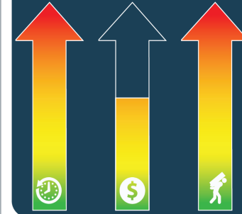
IMPACT ON OWNER

I would like to manage all components of the project on my own including purchasing materials and seeking my own specialty trades and or doing a portion of the work myself